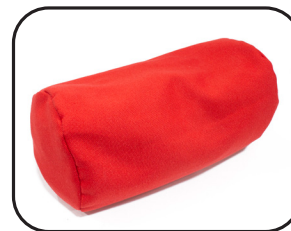
Round Tube Body Bolster (Short and Wide)