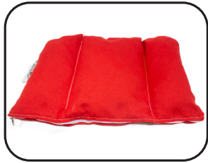
3-Panel Head Cushion

Posture2Go cushions ensure proper positioning and comfort no matter where you are.