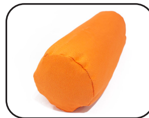
Round Tube Body Bolster (Long and Thin)